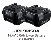
JPL91450A 14.4V 5.0Ah Li-ion Battery X 2 PACKS