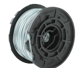
TW1061-S Stainless Steel